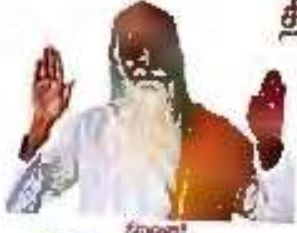
தலைவர் திருப்பூர் சாமுண்டிபுரம் மனவளக்கலை மன்றம்

திருப்பூர் சாமுண்டிபுரம் மனவளக்கலை மன்ற அறக்கட்டளை (யோகா மற்றும் ஆன்மீக கல்வி கழகம்)