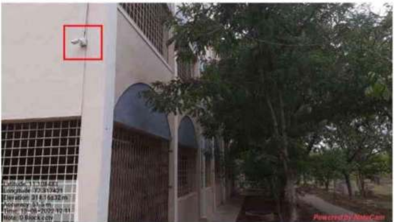
CCTV IN D BLOCK