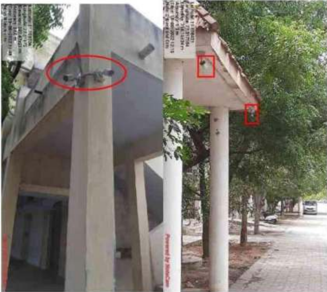
CCTV IN A, B AND C BLOCK